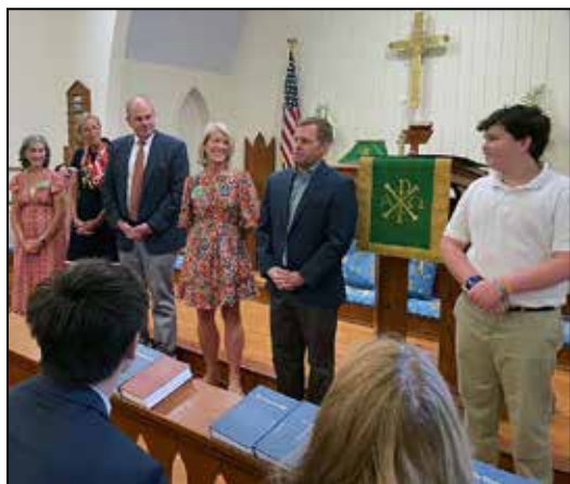
Blessing of birthdays and anniversaries

The people, the place, the worship, the work: these key elements that make our St. Mary's community who we are bind us together as a family. Our parish family continues to grow, and our resources must expand to welcome newcomers and continue to serve people beyond our campus.