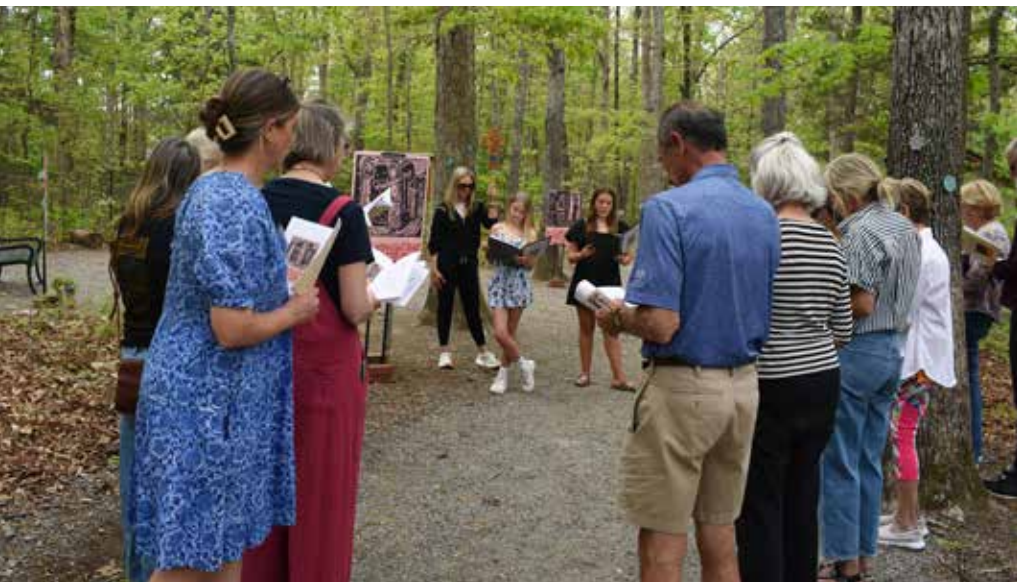
Stations of the Cross on the Nature Trail