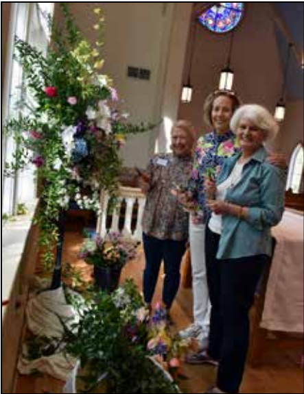
Clockwise from top left: Shrove Tuesday pancake supper, Confirmation, BBQ & Brews, Altar Guild, Ecuador mission