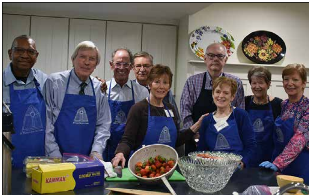
Our Fellowship Ministry feeds us well throughout the year.