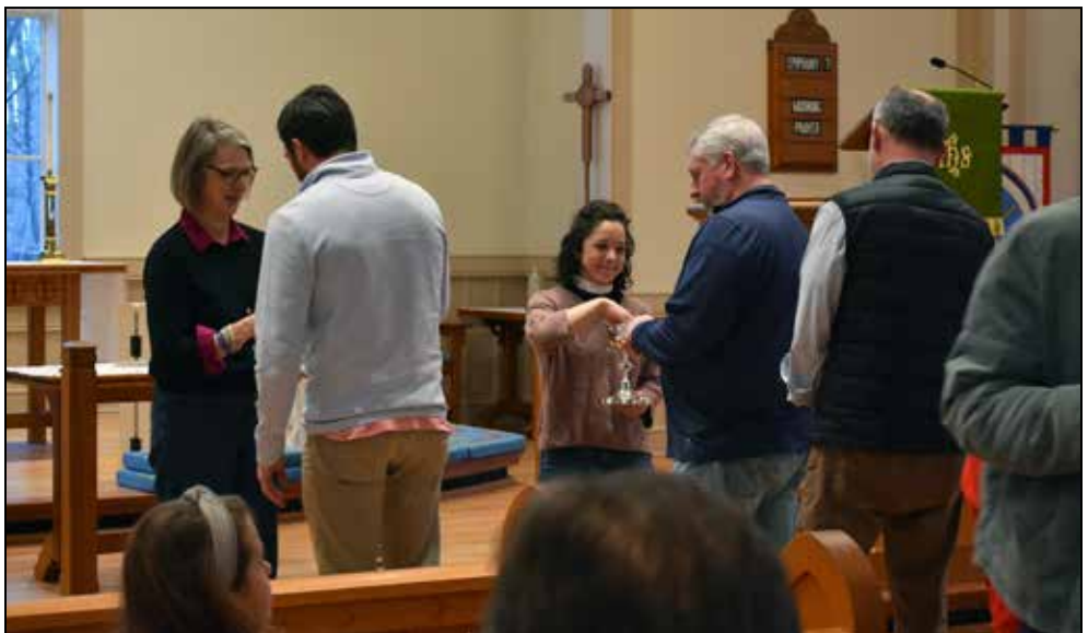
Sunday evening service