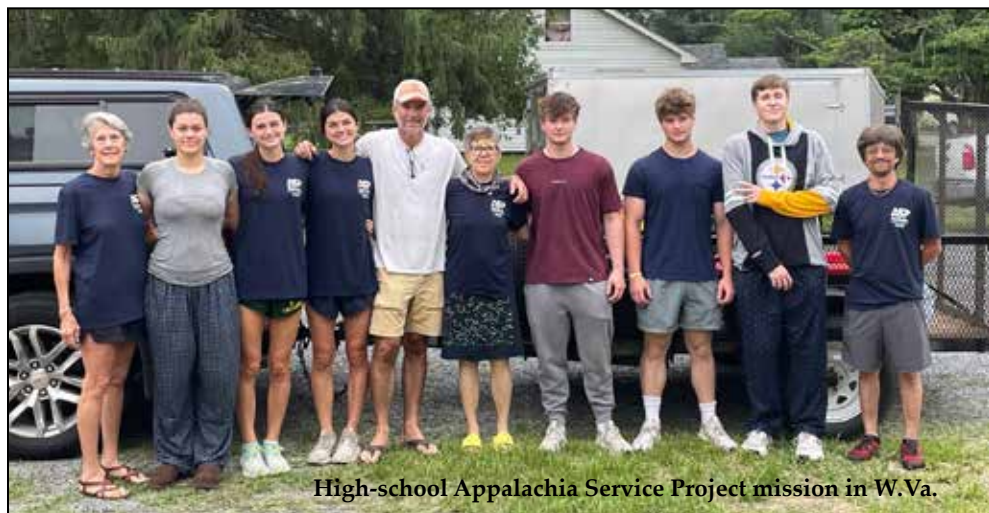
High-school Appalachia Service Project mission in W.Va.

Please pray fervently with a grateful heart to be good stewards of our gifts to our families and our community. Let us do God's work with a thankful heart.