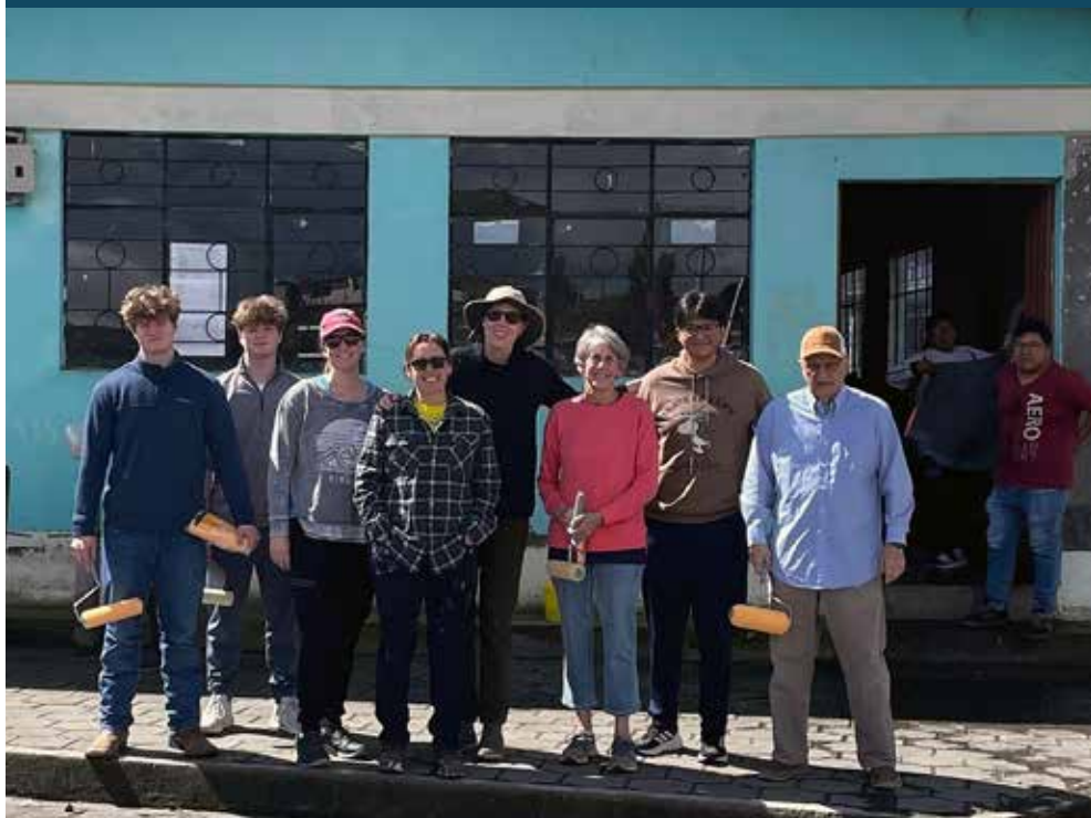
Missions to Virginia's Eastern Shore (top) and Ecuador (bottom)

From fellowship and formation to outreach both local and far afield, the people of St. Mary's have responded to God's call for us.