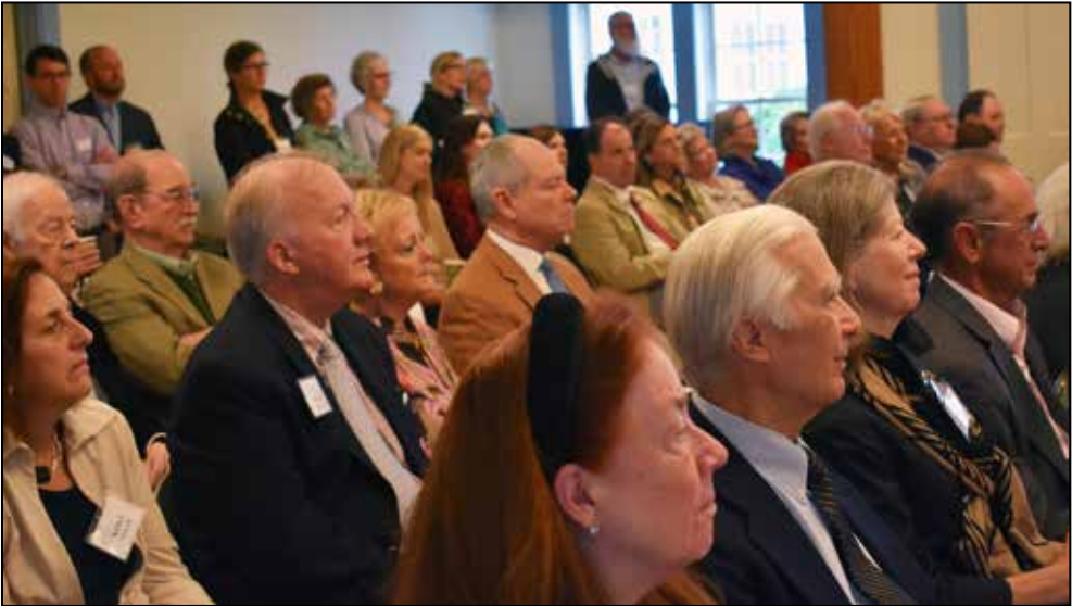
Sunday School (top), Adult Forum (center), Youth Recognition Sunday (bottom)