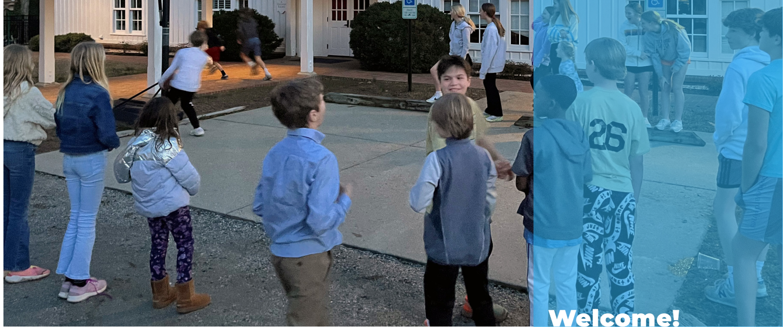
Youth enjoying a game of Knock Out after family worship & potluck